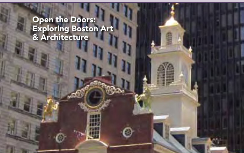
Open the Doors: Exploring Boston Art & Architecture

S1 Saturday 10 a.m.-noon S Bradshaw Room TBA 03/24/11