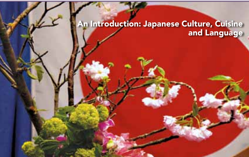
An Introduction: Japanese Culture, Cuisine and Language

Before BSL students can enter academic ESL courses, they must take a placement test in the Assessment Center, Room B118, Charlestown Campus.