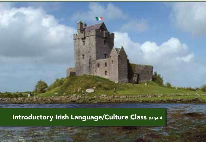
Introductory Irish Language/Culture Class page 4