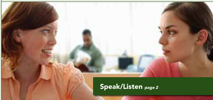
Speak/Listen page 2

Before BSL students can enter academic ESL courses, they must take a placement test in the Assessment Center, Room B118.