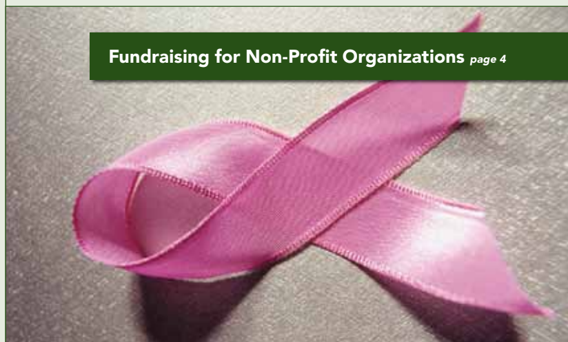
Fundraising for Non-Profit Organizations page 4

Learn how to be a fundraiser. Explore new territory prospect development, donor cultivation and stewardship, special events, online auctions, e-newsletters, partnering with board members and key stakeholders, obtaining sponsorships, creating and using social media (LinkedIn, Facebook, Twitter, Pinterest), annual and holiday