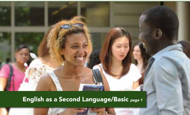
English as a Second Language/Basic page 1