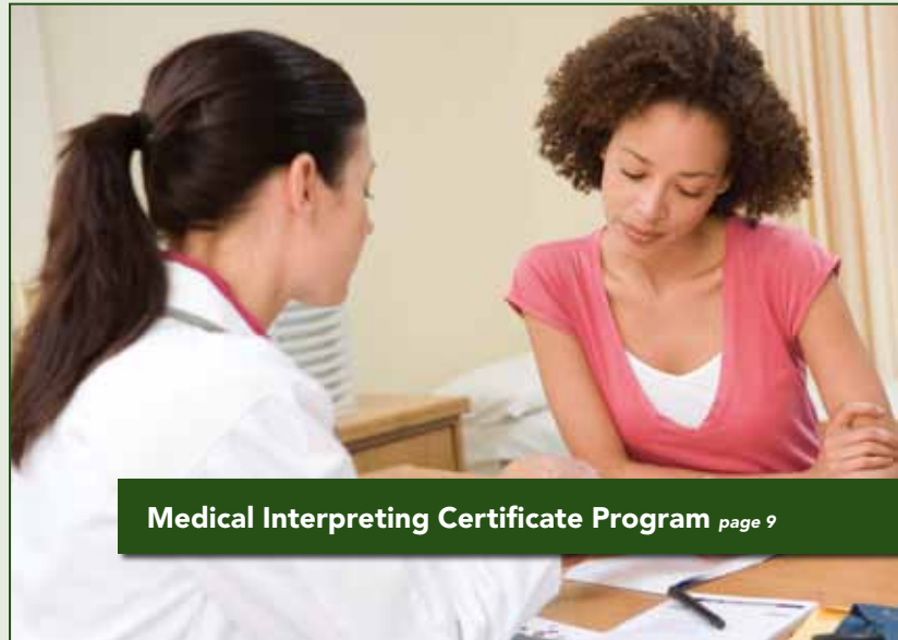
Medical Interpreting Certificate Program page 9

W1 Wednesdays 6-9 p.m. M Griffin D117 March 27-May 1