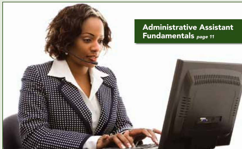
Administrative Assistant Fundamentals page 11

Create and post your own Website on the Internet using HTML in this extensive hands-on, six-week workshop. First, you'll learn about the capabilities of the World Wide Web and the fundamentals of Web design. Then, with your instructor's guidance, you'll plan the content, structure and layout of your Web site, create pages full of formatted text, build links between the pages and to the outside world, and add color, backgrounds, graphics and tables. You'll also learn critical and timely information on securing the best possible location in search engine listings and powerful no- or low-cost Web marketing strategies. To register, go to: ed2go.com/bunkerhill